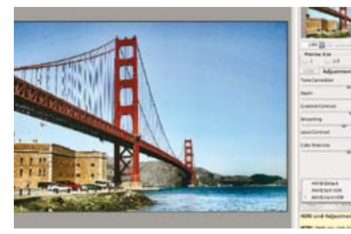
The program comes with just two additional presets, but you can easily create and save your own