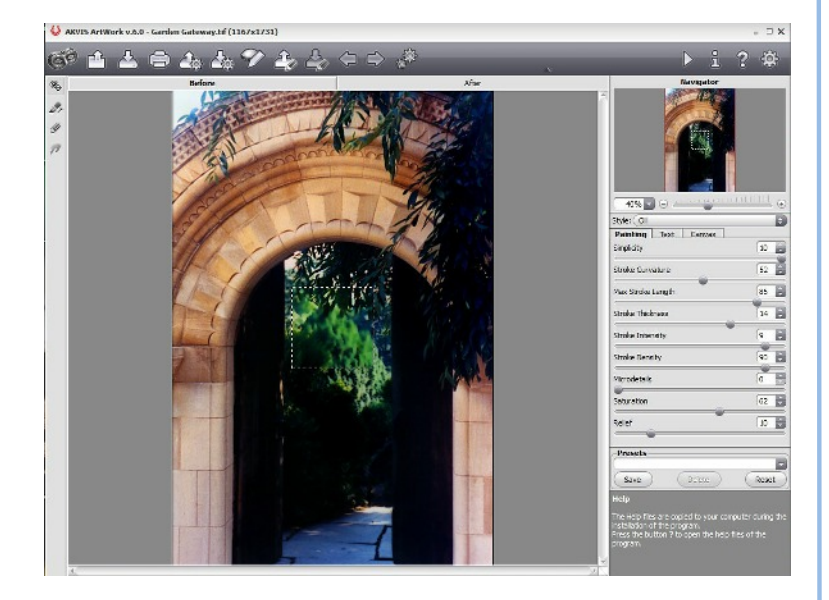
Using the watercolor effect

This plug-incan transform photos into paintings using various techniques. They are Oil, Watercolor, Comics, Pen & Ink, Linocut, and Pastel.