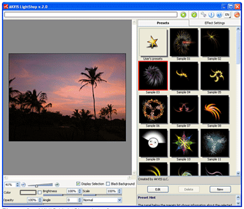
Figure 2 : AKVIS LightShop Interface

3. This will open the LightShop 2 interface that you can see in the Figure 2 below.