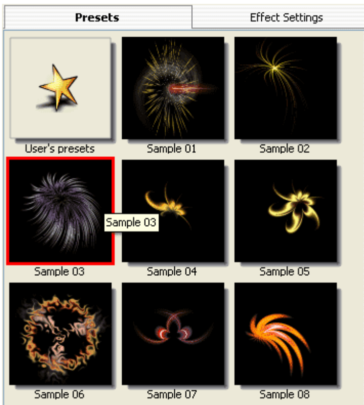
Figure 3 : Light Presets

6. Once the light is selected, double click to open Effect Settings - where you can change the properties of the light as required (see Figure 4 ).