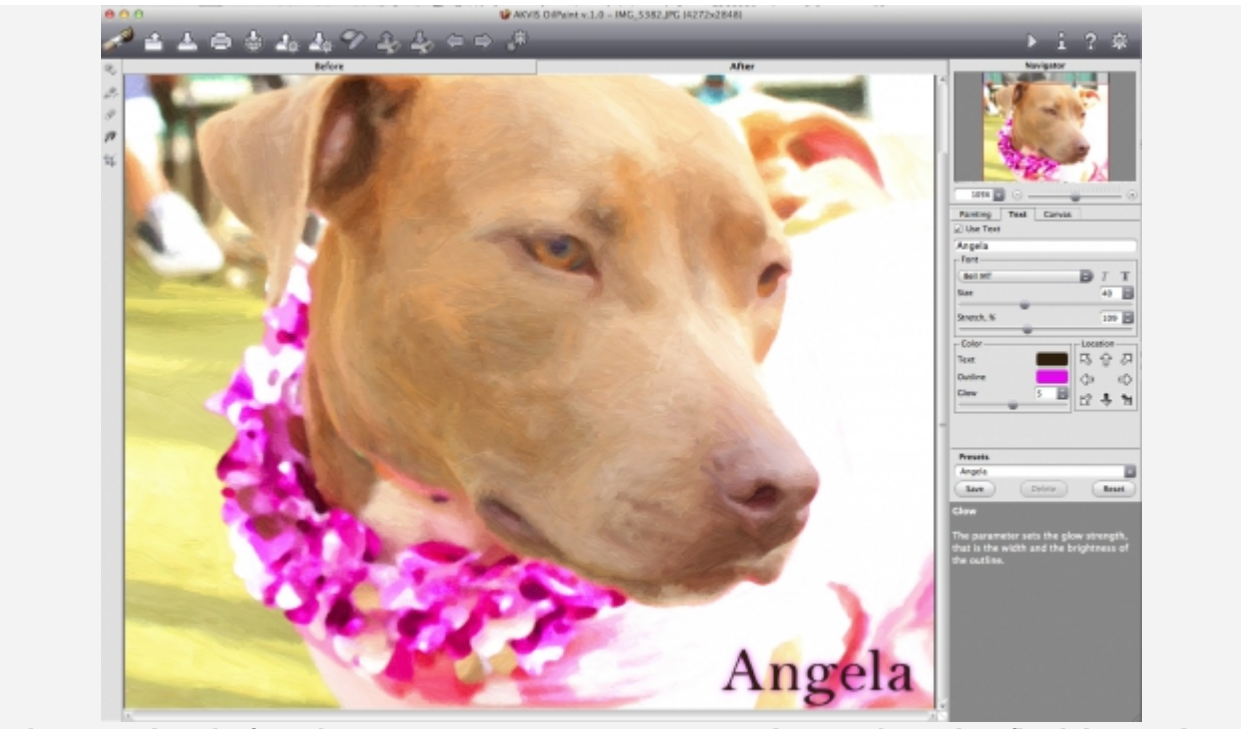
The text tool works from the navigation pane, not in its own text box. So there's less flexibility in where to place text.

While the concept of a standalone oil painting app might seem inconvenient to those who are used to one-stop-shop editing, it makes sense for OilPaint to focus on what it's designed to do. Plus, if you use the plug-in, you can load it through the host program.