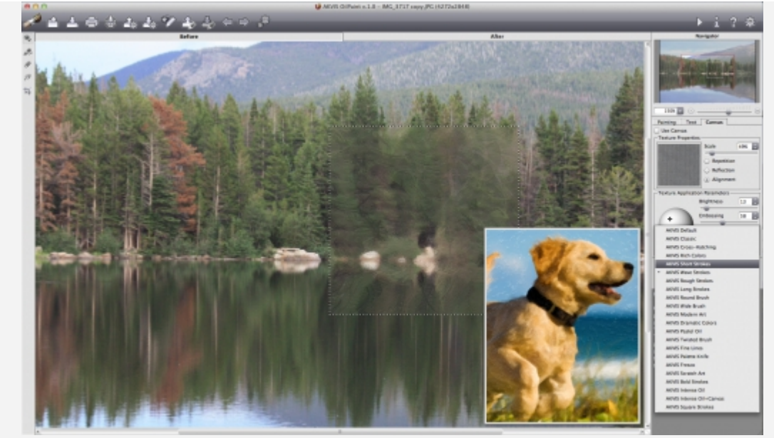
Within the Painting tab, multiple adjustable presets let you visualize the style of your painting.