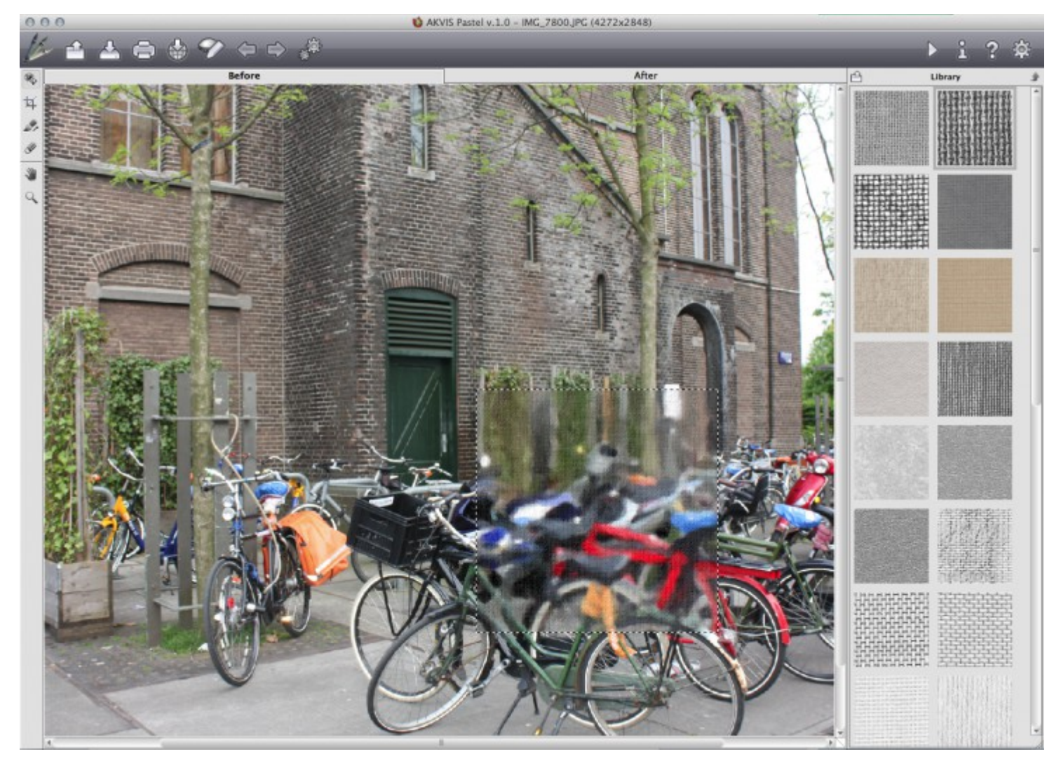
Pastel paintings will look different depending on the painting surface. Pastel offers a selection to choose from.

A batch processing option lets you apply an artistic effect to a folder full of images automatically converting all pictures, great for styling a blog or book.