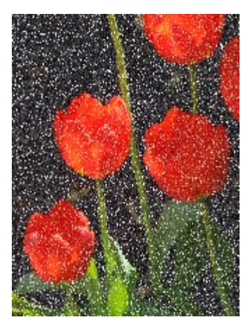
image. The image on the left is the final results from my adjustments, while the one on the right is one produced by an AKVIS pre-loaded preset, Bubbles. There are many more presets to try as well.

When you like what you see, press the Run button (next to the I (info) icon) to apply the effect to the entire