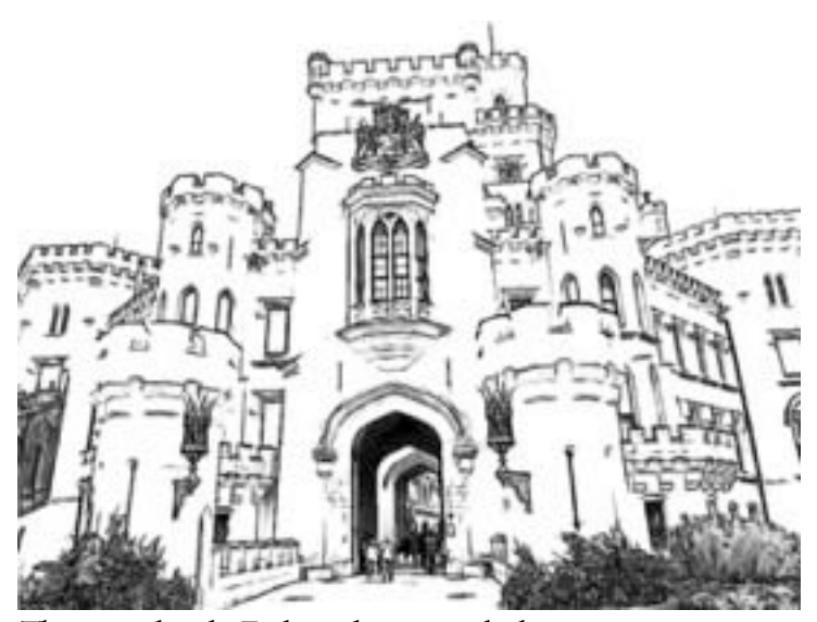
This image has the Embossed preset applied.

plication, but I was also able to test the Akvis Sketch Plug-in with my Adobe Photoshop CS6. The plug-in worked exactly like the stand alone version. No compatibility problems, etc.