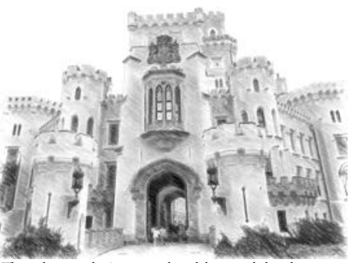
This is drawn in the Artistic mode with loose angled strokes.

Evaluation : Akvis Sketch accomplishes what it sets out to do-convert photos into works of art. If you are interested, I suggest you download the demo and see if it suits your needs. BTW: I used Final Cut Pro, Adobe Photoshop, and the Sketch plug-in to successfully create a (colored) animation of a person walking down the sidewalk! Now that I know how to do it, it is a breeze to make short animations. I will be making more animated cartoons in the future.