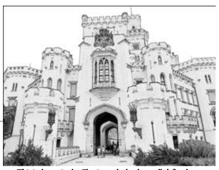
This is drawn in the Classic mode that has well-defined contour lines.