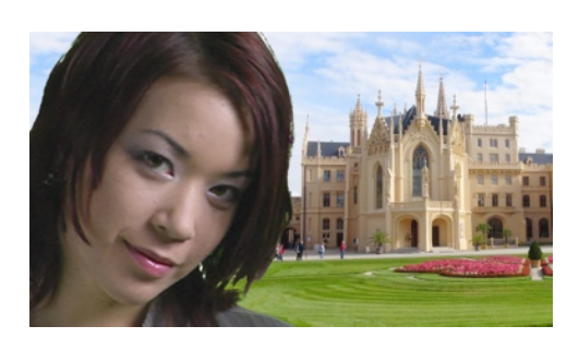
SmartMask helped me quickly remove the green background from this model's photo so I could make it look like her photo was taken at the Lednice chateau in the Czech Republic. If you look closely, I selected four different greens that I wanted removed and three different browns (for her hair) that I wanted to keep.