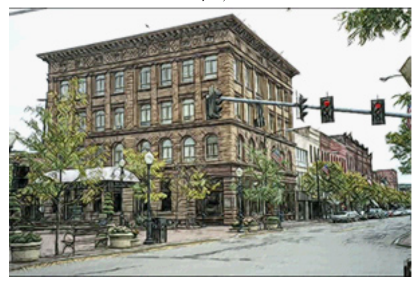
You can come up with some interesting results whether you use Akvis Sketch on buildings or portraits.

If you want to make you image look like a watercolor drawing, simply adjust the Coloration slider. The higher you move the slider, the more color shows through (from the original photo). Once you are satisfied with the results, simply click the Run button and your photo is instantly adjusted.